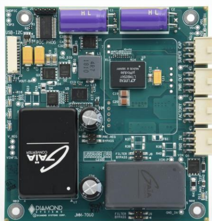
JMM-7312-UPS Military-Grade Non-Isolated