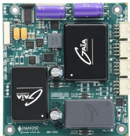
JMM-7312-ISO-UPS Military-Grade with Isolation