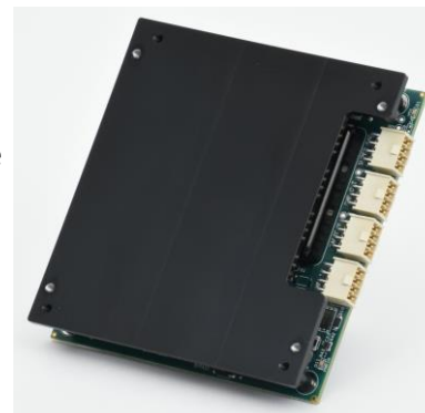
Integrated heat spreader supplied with all models